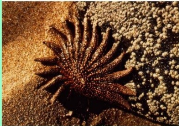
Heliaster and Sea fan