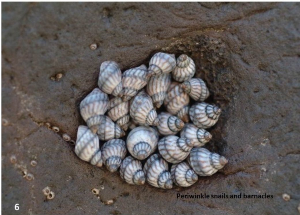
Periwinkle snails and barnacles