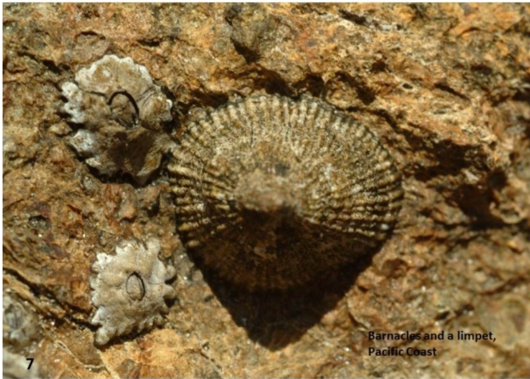
Barnacles and a limpet, Pacific Coast