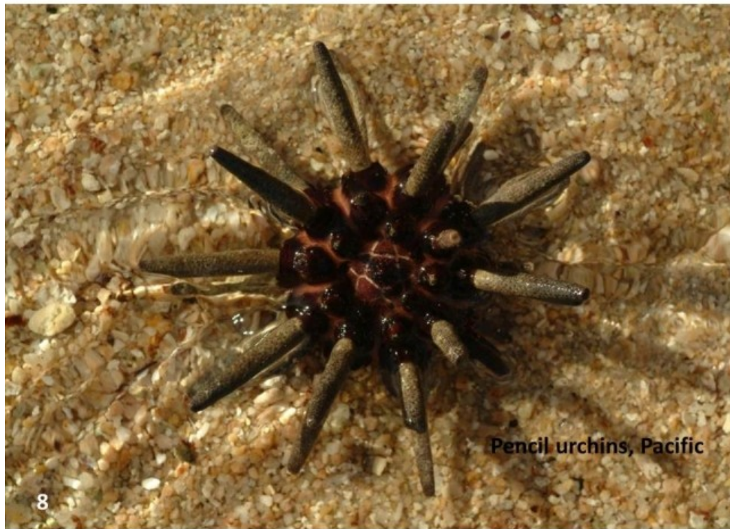
Pencil urchins, Pacific