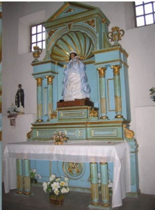
Our Lady of Loreto